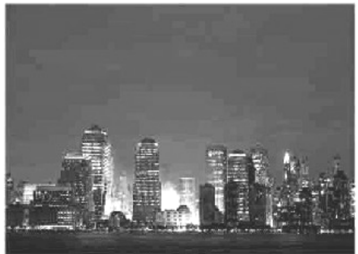
Oct. 12, 2001