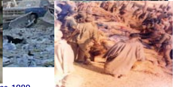
New York Sept 2001 & Kashmir since 1980