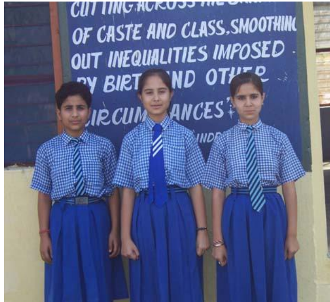
PRIDE OF OUR COMMUNITY

September 13, 2007: Inspiring news from Udhampur