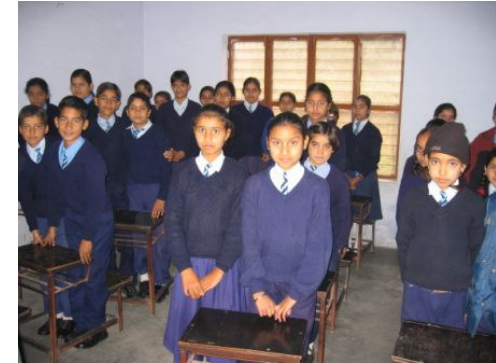
Tomorrow looks bright: Protecting core values

Selected students are notified about their sponsor family and the sponsor is also informed about the student so that they can get in touch with each other directly. The program coordinator at KP Sabha, Jammu, monitors every student's progress and is conveyed to the sponsor family from time to time.