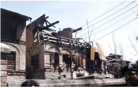
The ugly face of terrorism: Destroyed homes of community