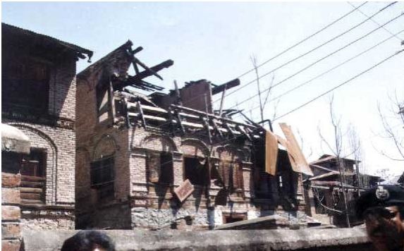
The ugly face of terrorism: Destroyed homes of community

In 1990, terrorism and sectarian violence caused nearly 500,000 Kashmiri Hindus to flee the land of their ancestors, the fabled valley of Kashmir in the Indian state of Jammu and Kashmir. These victims of terrorism, refugees in their own country, left behind virtually all of their worldly possessions, as they had to flee under threat to life and honor.