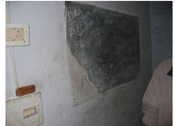
Badly needed infrastructure e.g. Classroom blackboards

1. Due to extremely tight operating budgets, often managed in deficit, the school is unable to provide a competitive learning environment to its students in the first through eighth grades. This category includes basics such as classroom supplies, learning materials, computers, and even teachers' salaries.