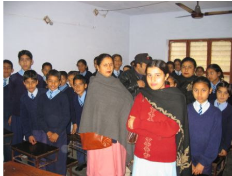
Selfless Volunteers: Winning against all odds

Since its humble beginnings, a group of dedicated individuals from within this refugee community has succeeded in sustaining and growing this school against all odds. Today, the Rishi Memorial School educates nearly 200 students in the first through eighth grades. Not only does this school serve the refugee Kashmiri Hindus but it is also spreading the light of education among underprivileged children of the host community. Over a dozen selfless and dedicated educators are managing this school with minimal compensation.