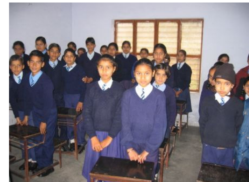
Tomorrow looks bright: Protecting core values

Together we can make a difference in the lives of our less fortunate brethren. We thank you again for your support.