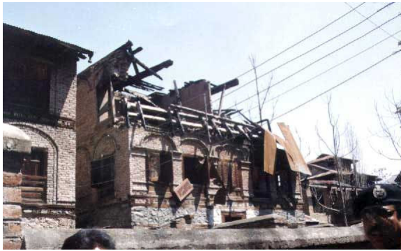
The ugly face of terrorism: Destroyed homes of community

The refugee camps in Jammu and Kashmir house hundreds of thousands of Kashmiri Pandits displaced from their homes as a direct result of the Islamic militancy in the valley. This tragedy has resulted in children being denied the opportunities that we take for granted. Since 1995, the Kashmiri Overseas Association, USA has implemented the Sponsor-A-Child Program for the age group 5 year olds to 17 year olds. This program aims to provide educational opportunities to the children directly affected by the tragedy. While individuals worldwide have contributed to these programs more children are in need of our financial support than currently available funds can support, there are many more that deserve our assistance.