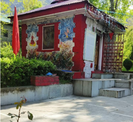
Pre-renovation status (Taposthal and Spring)