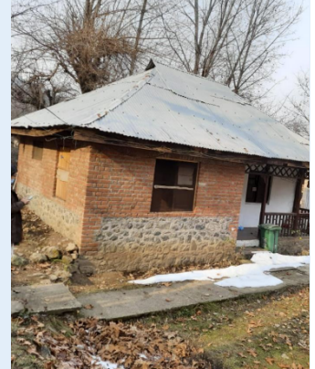
Pre-renovation status (Residential and Admin Zones)

SIGNIFICANCE: This serene ~1 acre site, named after the spring revealed by Mata Ropa Bhawani, is located on prime land in the safe vicinity of Raj Bhawan and Chashma-Shahi garden in Srinagar. The temple's location is one of the primary sites where Mata Roop Bhawani performed her tapasya and other spiritual practices. Her teachings and mystic poetry have left an indelible mark on Kashmiri Pandit culture, blending elements of Kashmir Shaivism and Sufism.